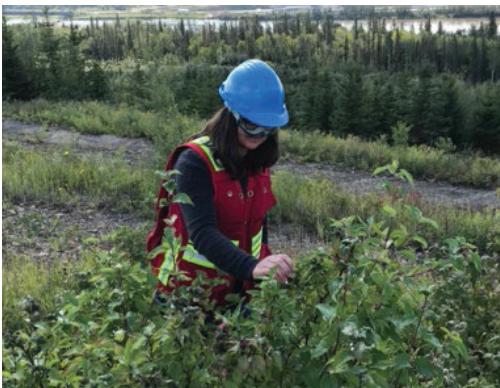
Co-researchers touring reclaimed upland forests at an oil sands mine in the Fort McKay Traditional Territory, Northeast Alberta, Canada